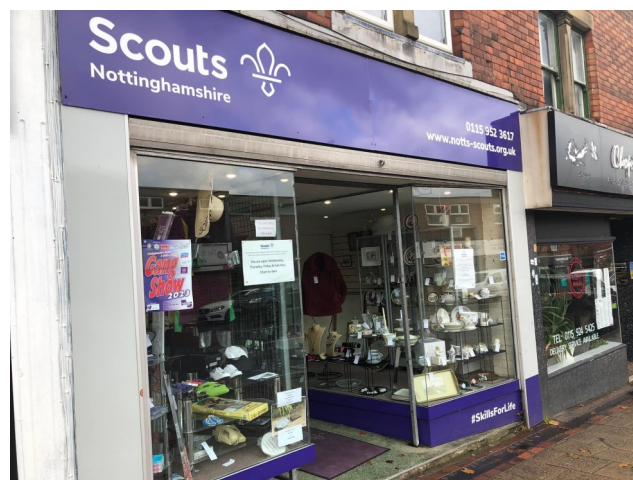
Sherwood Scout Shop – 606 Mansfield Road, Sherwood.

Would you like to join them? If, yes, contact the County Office on 0115 952 3617 or email office@notts-scouts.org.uk